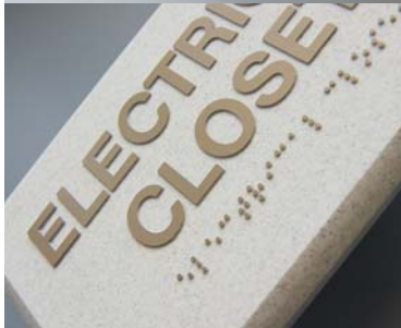
Corian Material Featured

The Graphic Blast process may be used with a variety of materials to create a versatile portfolio of applications. Many solid surface materials and other materials including: corian, avonite, marble and tile may be used to create ada conforming signs with 1/32" raised characters and graphics. Typical applications are hospitality, residential and corporate environments.