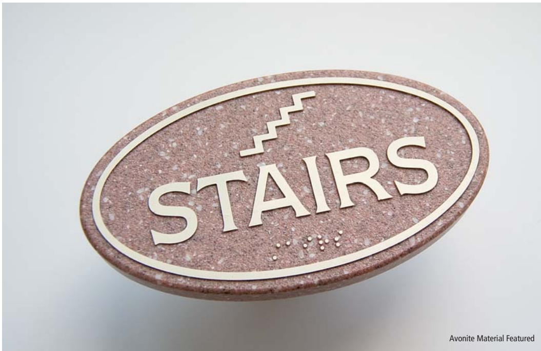
Avonite Material Featured