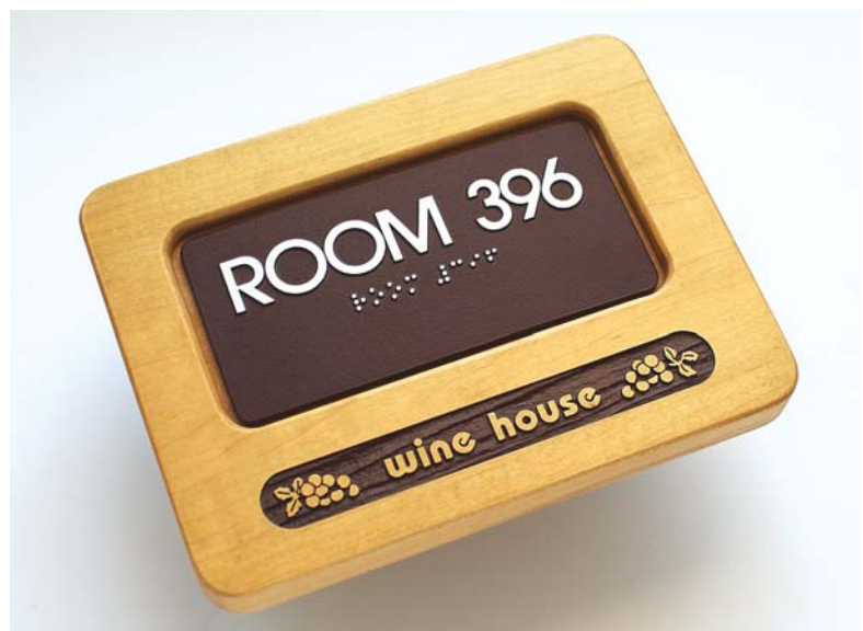
Wood Frame with Graphic Blast MP ADA Sign insert

Most Graphic Blast products may be manufactured to Rounded Grade II Braille or Grade II Braille standards. Photographs that feature Braille the same color as the text are Grade II Braille. Those that feature Braille in the same color as the background are Rounded Grade II Braille. Wood products are available in Grade II Braille only.