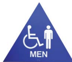
California Code Accessibility Signs