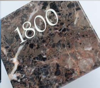
Marbled Tile Material Featured