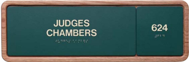
Graphic Blast MP recessed within wood-frame