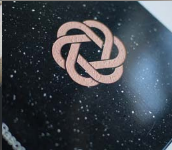
Avonite Material Featured